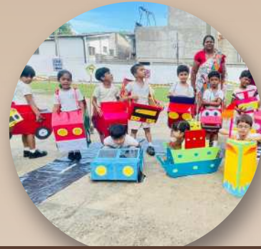
Learning modes of transports