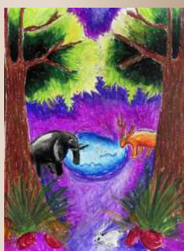
N. Kavinash 7 National RI HAVELOCK TOWN