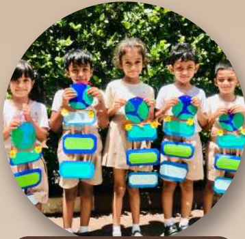
World Earth Day