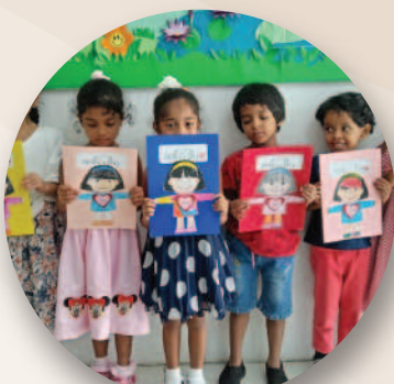
Celebrating Mothers' Day