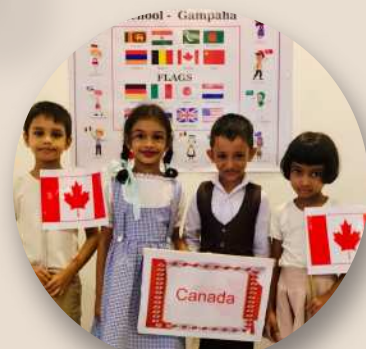
Learning about flags