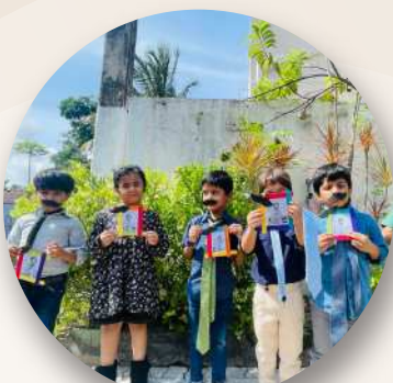
Celebrating Fathers' Day