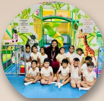
Field trip to the Fun Factory