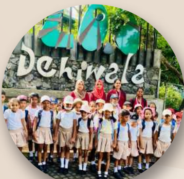
Field trip to the zoo