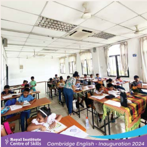
Royal Institute Centre of Skills Cambridge English - Inauguration 2024

RICS has launched its new Toastmasters courses, marking an exciting beginning for students to master the art of communication. Featuring the Youth Leadership Programme and Speech Craft Programme, RICS offers opportunities for young aspiring leaders and adults alike to develop public speaking and leadership skills. Through innovative student-centered approaches, RICS fosters practical abilities and confidence, equipping students to thrive in a globalized world. Accredited by internationally recognized institutions, these programmes meet high standards and enhance employability, supporting students' professional growth. With a network of over 2,000 students, 30+ annual exams, and 20+ preparation centers across the island, RICS continues to set a benchmark in quality education, making language learning engaging and effective.